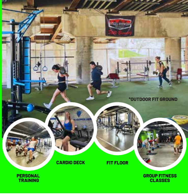
*OUTDOOR FIT GROUND

Marketing Musikfest Performances Plaza Tropical